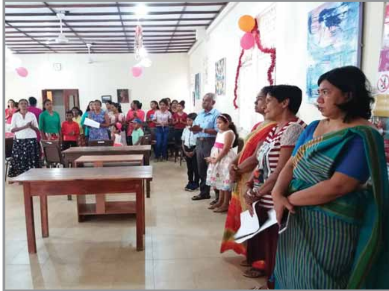
Cancer Survivors and visitors are singing a healing Hymn, before commencement of the Annual Christmas Party at the Head Office in 2019.