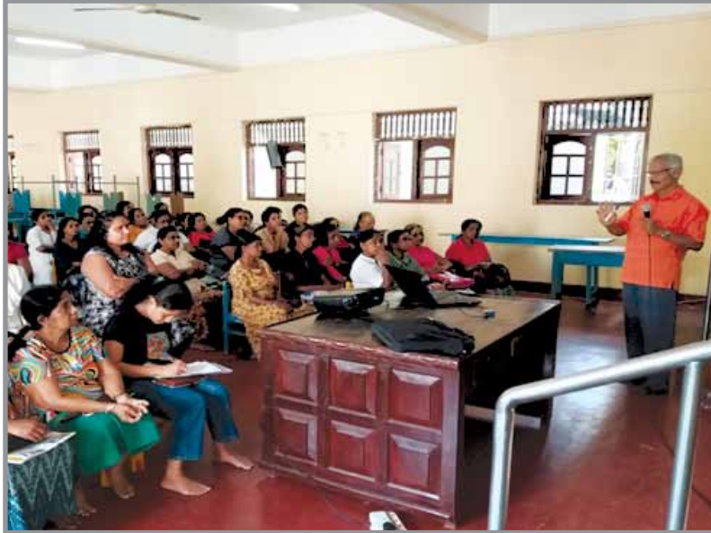
Awareness programme held at the Women Welfare Organization – Kelaniya