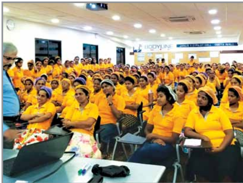
“Attention before Risk” – Aloka Cancer Awareness programme held at the Bodyline Garments, Horana.