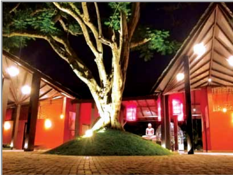
Sath Sith-Sath Kam Palliative Care Centre' (Hospice) in Karapitiya