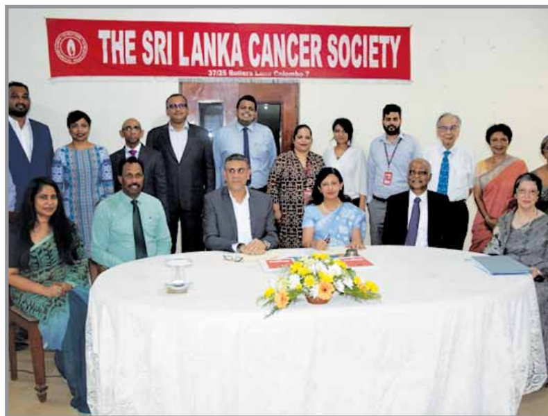
After signing the MOU with AIA (Sri Lanka Cancer Society first Corporate Charity Partner) for the year 2020 on February 27, 2020