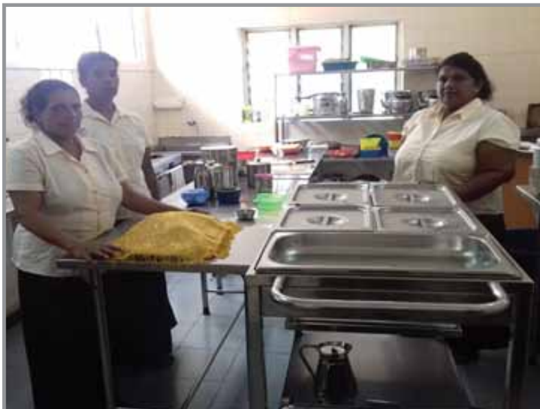
Preparation to offer the “Buddha Pooja” before serving Lunch to patients.